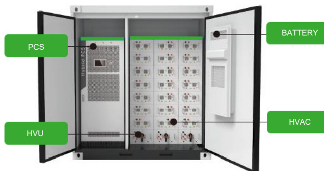
The graphics shown may differ from the actual structure.